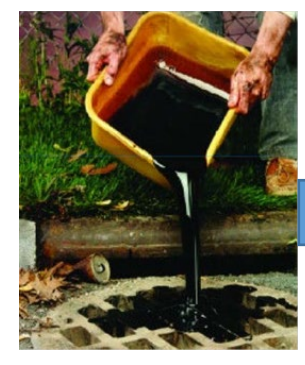
Dumping oil down a storm sewer catch basin

The City of Moorhead is committed to improving water quality and reducing the amount of pollutants entering waterways.